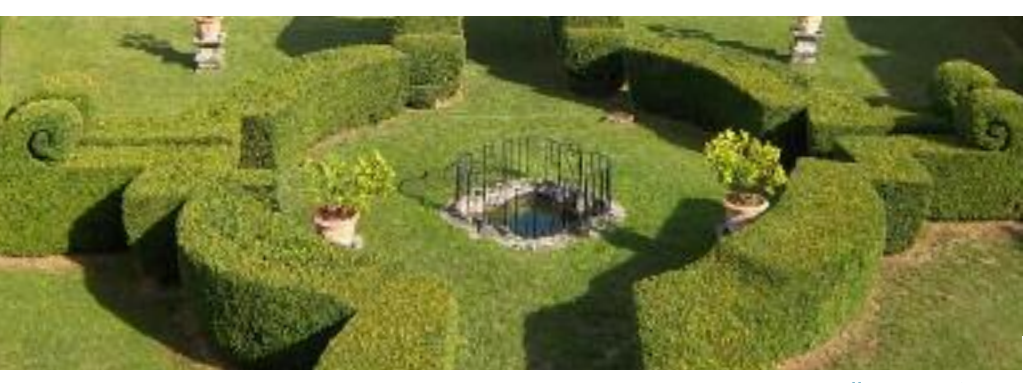
Villa Pavesi Negri

Cristoforo village. Here, in 1948, the most northern stele statue of Lunigiana was found, as well as one of the oldest. By going up the valley towards Zeri you can reach Arzelato, a centre situated on the back of a spur of Mount Rotondo, from which you can enjoy a splendid view on the countries of the valley floor. The church is dedicated to St. Michael the Archangel. By going down back to Pontremoli, you can visit the ancient Saliceto parish known as the Parish of the saints Ippolito and Cassiano Urceola and lately, the subject of archaeological excavations. Not far away, opposite the Magra river and among the streams Gordana and Teglia, you can find Oppilo, among slopes adorned with vineyards. By following the provincial road again, you reach, just after the industrial area of Novoleto, the village Teglia, marked by a Romanesque bell. Above a bight of the homonymous river stands the eighteenth century Pavesi Negri Villa.